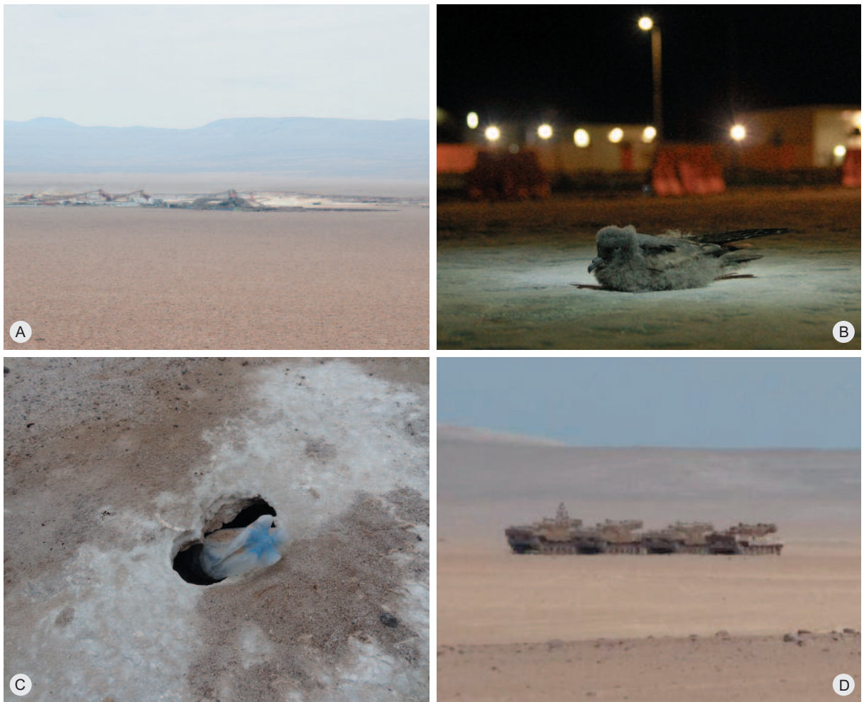
Figure 3. Main threats affecting the Markham's Storm-Petrel: (A) Mining facilities, which directly destroy the colonies and create light pollution by night; (B) Light pollution, which triggers fledgling fall-out; (C) Litter from roads, which blocks the entrances of the cavities, and (D) military training exercises, which destroy the salt substrate and may cause the collapse of cavities.

plastic bottles, which can block the entrances of the cavities. This happens even at dozens of kilometres from the roads due to the wind (Figure 3), (3) military training exercises (tanks moving and testing of bombs), which destroy the salt substrate and may cause the collapse of cavities (Figure 3), (4) power lines that cross the colony, creating a potential collision threat, and (5) mining, energy plants and road works installations, which directly destroy the salt substrate (Figure 3).